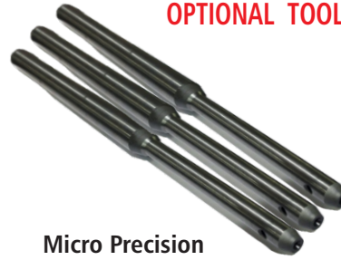
Micro Precision Carbide Pilots (0.0001" increments)