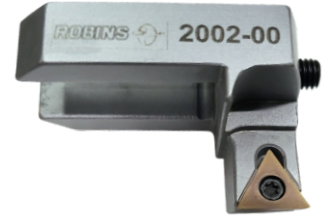
Counter Bore tooling removes old seats easily