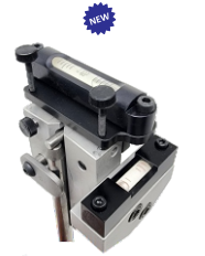
Dual Axis Canted Level

Robins exclusive patented multi-angle seat tooling eliminates the need for bounce springs. Robins patented tooling holds the ball driver firmly, yet allows the sphere to float during seat cutting. This eliminates the trouble-some bounce springs but gives you the ultimate in valve seat concentricity.