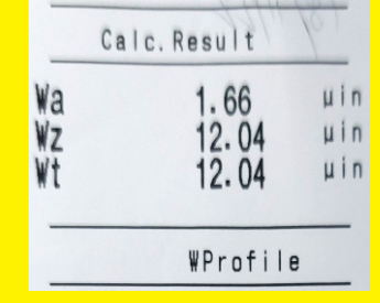
Surface finish down to 0.5 Ra mm Best in the industry